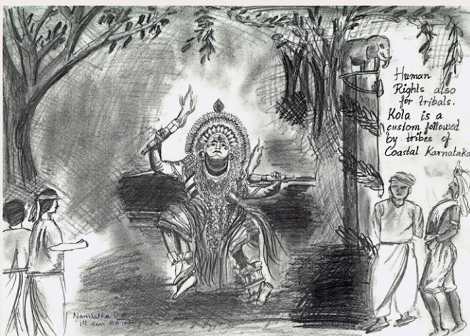
Namratha V.P., 1 st Sem. B.A.,LL.B. - 2 nd Place