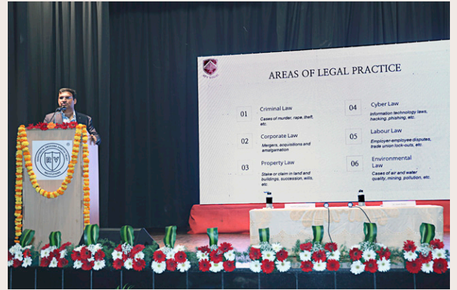
Orientation and Inauguration of 6 th batch of B.A.,LL.B. and B.B.A.,LL.B.