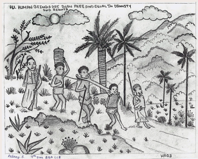
Ashray S., 7 th Sem. B.B.A.,LL.B. - 1 st Place