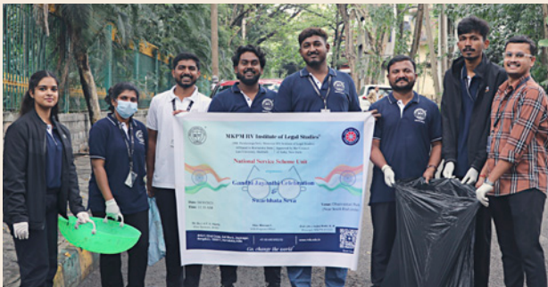
The National Service Scheme (NSS) Unit of MKPM RV Institute of Legal Studies organised a special event on 4 th October, 2025 to commemorate Gandhi Jayanti and promote the spirit of cleanliness through Swachhata Seva. The event commenced at 12:30 PM at Dhanvantari Park.

In observance of World Mental Health Day, the NSS Unit of MKPM RV Institute of Legal Studies is hosting a special three-day campus initiative titled “Manas Utsava” from 16 th to 18 th October, 2025. The programme aims to build a compassionate, emotionally aware and mentally healthy student community through thoughtfully curated activities, reflections and participatory events.